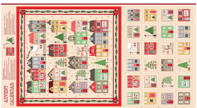
1981/1 Silent Night Advent Calendar Panel